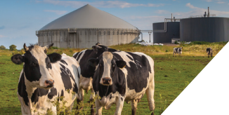
EXHIBIT 2: Components of a 2,500 Cow Dairy Digester Project